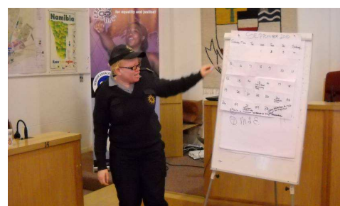
Figure 3: Participant presenting the group work