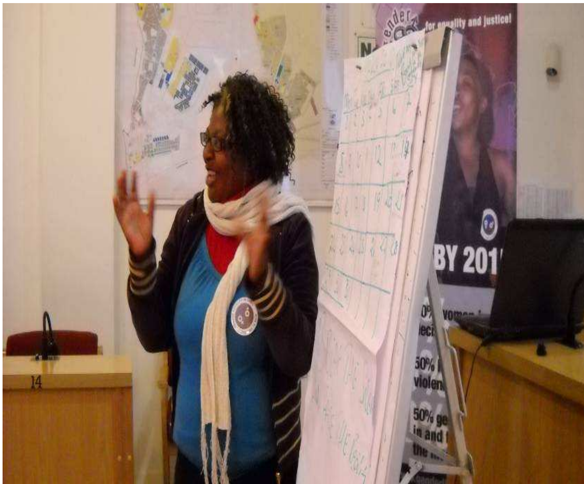
Figure 1: A participant presenting group work

Date: 18 – 19 August Venue: Swakopmund Town Council