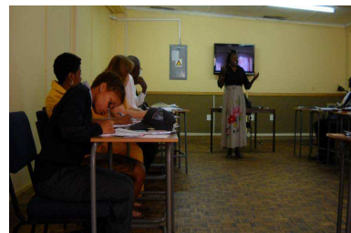
Figure 2: Facilitator engaging the participants