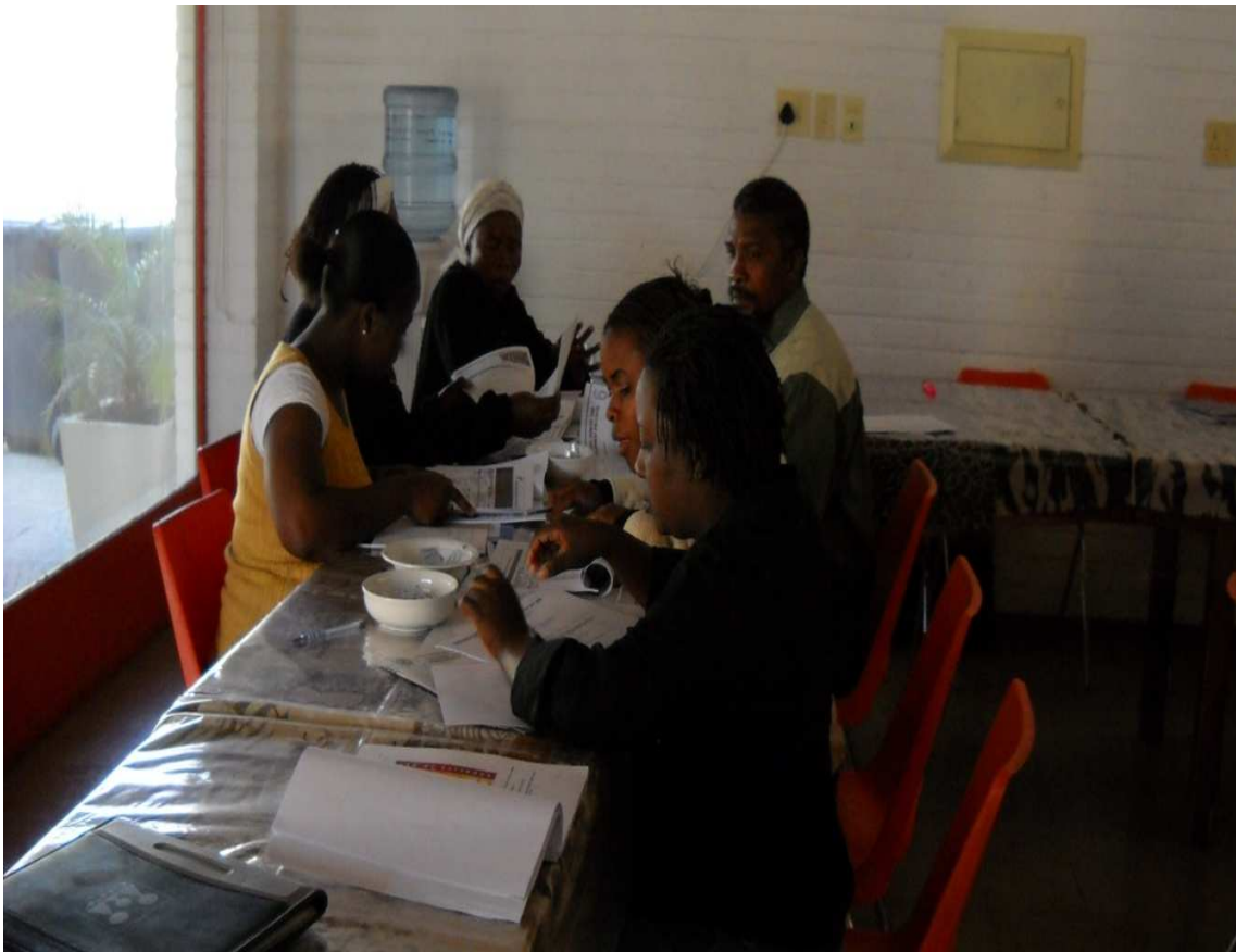
Figure 1: Otjiwarongo group members doing group work

Date: 10 – 11 September 2009 Venue: Otjiwarongo Town Council, Otjozondjuba Region