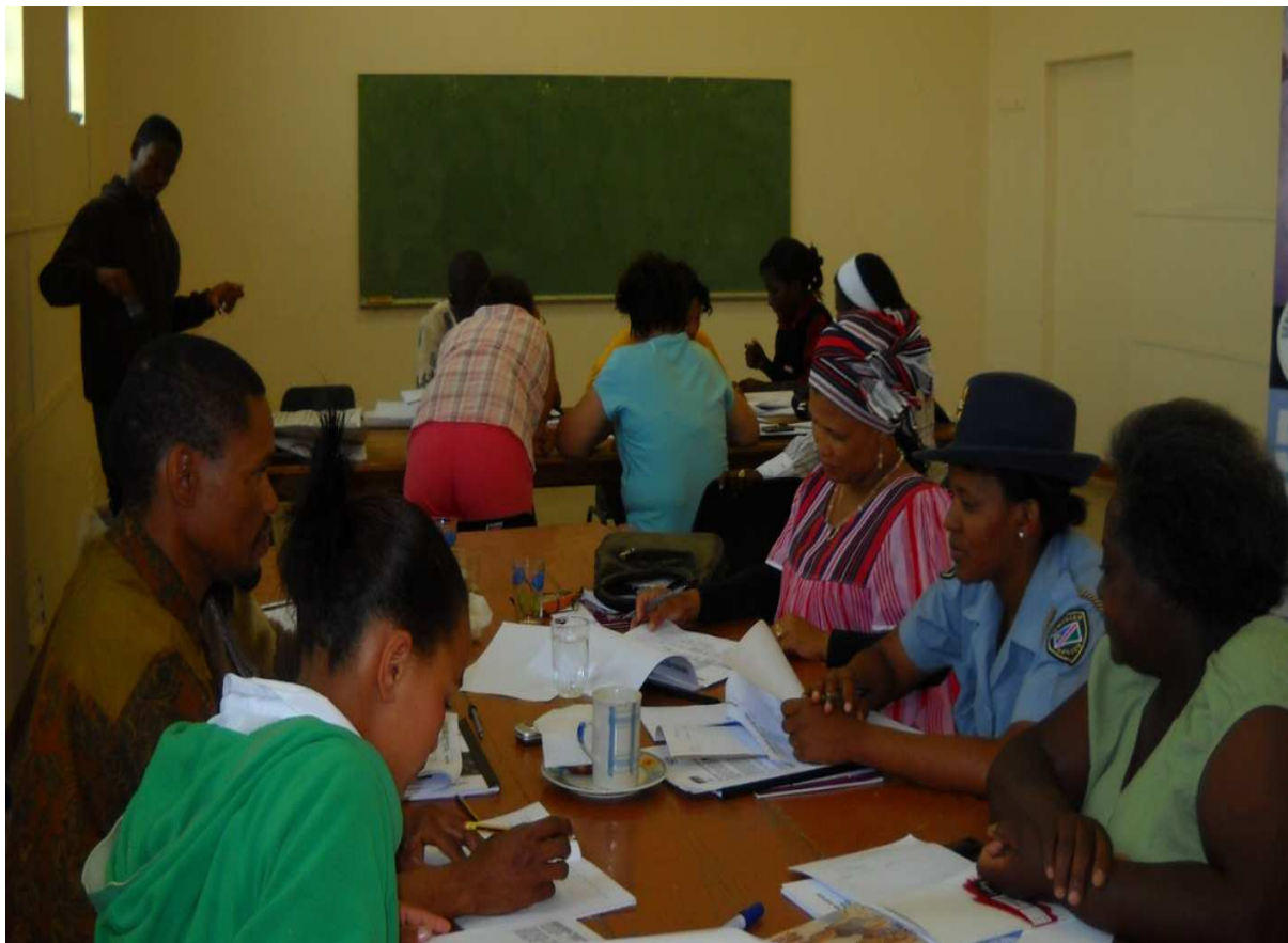
Figure 1: Karasburg participants doing planning

Date: 22 - 23 September 2009 Venue: Karasburg Town Council Hall