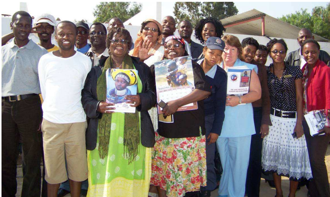
Figure 1: Group of Arandis participants

Date: 7 - 8 September 2009 Venue: Arandis Town Council Hall