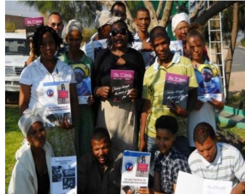
Koes village council

This was the first time they ALL saw the document and heard about the Protocol. They requested for a workshop that dealt with the Protocol in all its detail, for them to understand how they could make it relevant for their communities. They also asked that other gender instruments, international, regional and as well as locally be dealt with at such a workshop.