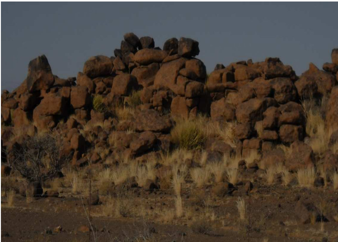
Koes tourism view: (Photo by Sarry Xoagus Eises)

Date: 1 – 2 September 2009 Venue: Koes Village Council